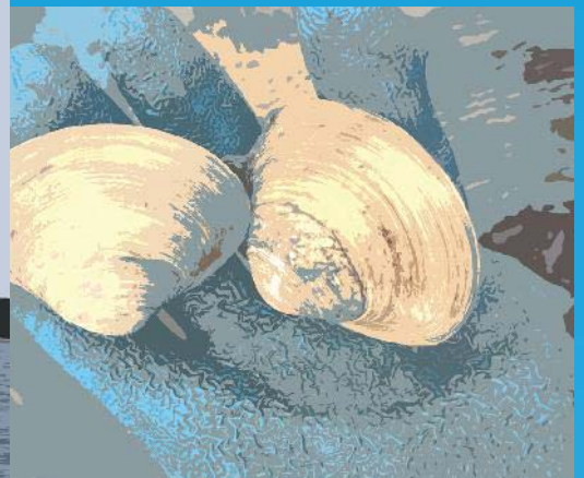
Brochure designed by the Town of Barnstable Consumer Affairs Division, 2017